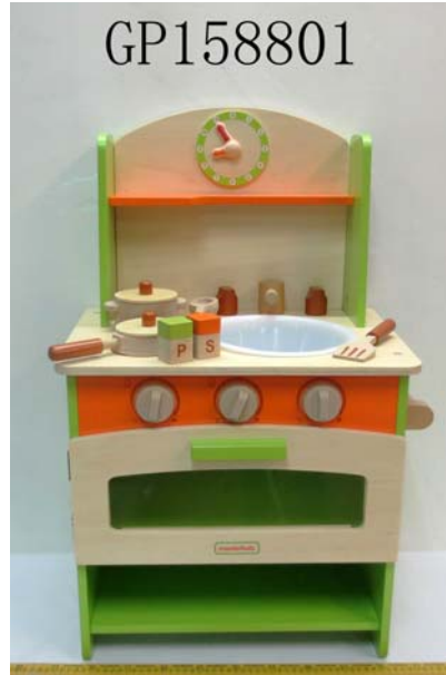
PHOTOGRAPH(S) OF THE SAMPLE ***** End of Document *****

Guangzhou Worldwide Standards and Testing Company Limited